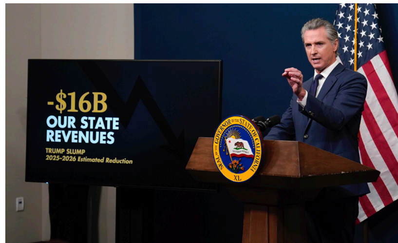
Gov. Gavin Newsom presents his revised 2025-26 state budget during a news conference in Sacramento on May 14, 2025.