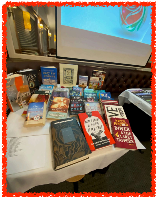
Books to Buy!