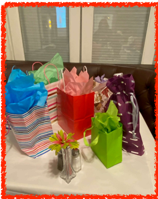
Prizes to win!