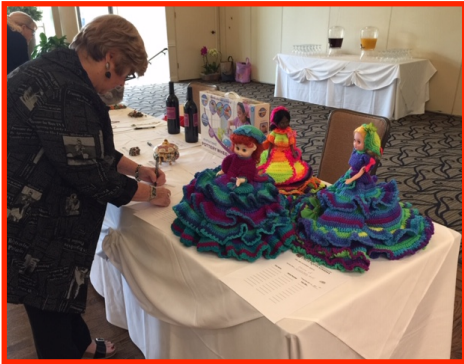
There were many silent auction items.